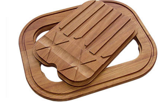
Iroko-wood twin chopping board 8644 003