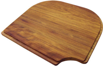
Iroko-wood chopping board 8659 111