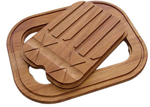
Iroko-wood twin chopping board 8644 003