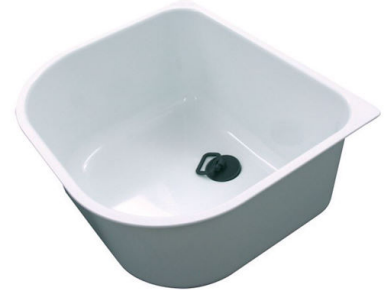
Vaschetta bianca 8152 100