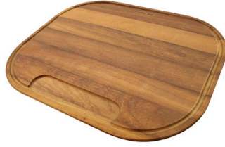
Iroko-wood chopping board 8659 112