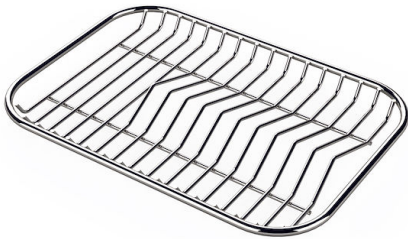
Stainless steel plate rack 8100 154