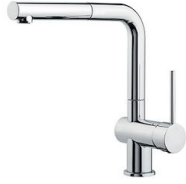
Mixer Tap Gamma 8483 001